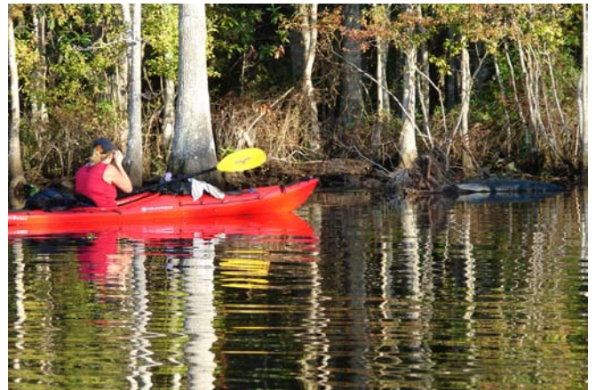
Paddling the Suwannee River.

These are just a few possibilities. Maps will be available. Bring bug spray and be sure to have all your safety gear aboard, including PFDs, whistles and flashlight. Inexperienced paddlers should not paddle alone! Watch this spot for updates as we may add a guided sunset paddle!