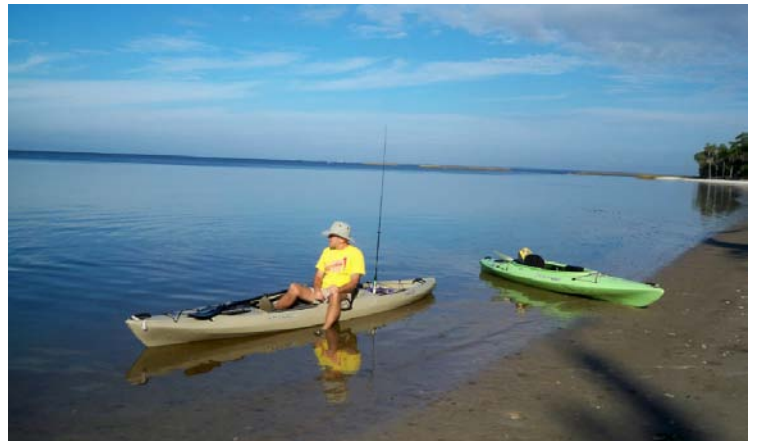
Coastal beaches and islands: A short paddle can take you a world away such as Big Pine Island near Shired Island beach.

wind is above 10 mph, then moderate skills are needed. The paddle will cancel if winds are above 15 mph. This event is free, but you must provide or rent your own equipment. (For boat rentals, see above.) This paddle will be repeated on Saturday morning.